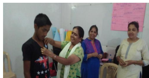
Child Leader receiving Badge in Pune

With the goal to increase access to priority health, educational, social protection and welfare services for children affected by HIV and AIDS (CABA), the project seeks to identify and profile girls and boys living with HIV early, and provide quality and timely treatment, care and support in order to prolong and maintain quality of life. It also works to increase access and utilization to priority health, educational, social protection and welfare services, by children affected by HIV and AIDS and their families and strengthen inter-sectoral collaboration between various government departments to ensure that CABA are provided all essential services.